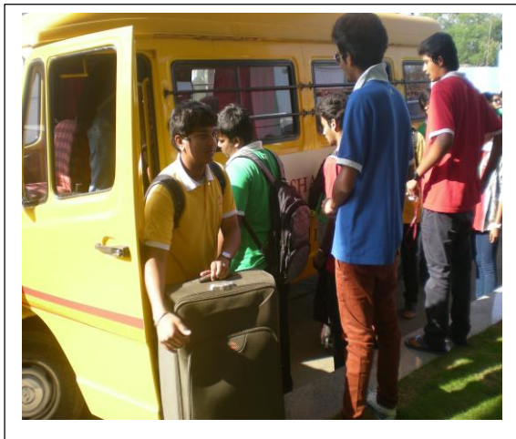
Unloading at Pune Airport