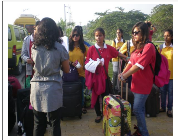
Ready for departure – At School Gate