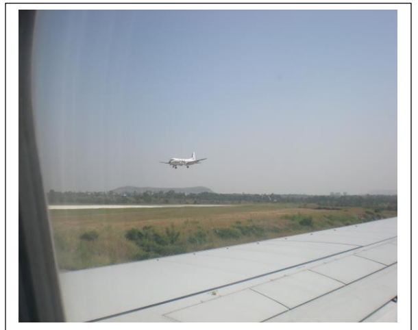
On the Runway