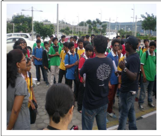
First Briefing at Chennai Airport