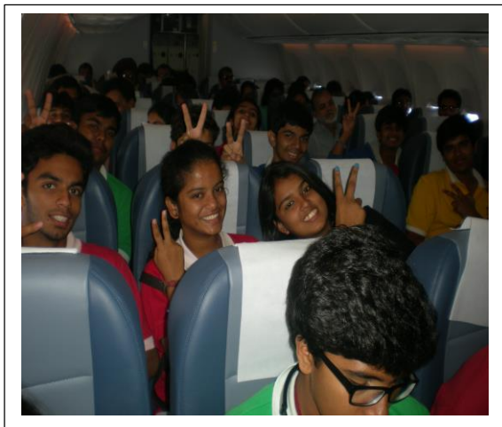
In the Flight