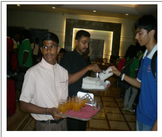
Welcome to Hotel Atithi